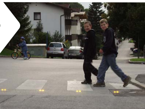
SWARCO FUTURIT's LANELIGHT LED ROAD MARKER: an important means in traffic guidance and safety