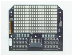
LED array that provides illumination and steerable beam