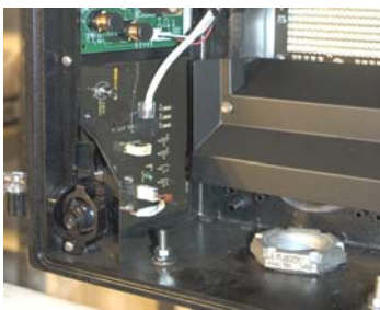
Optional Internal Stop Bar Detection Camera.