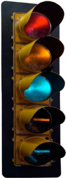
Electronically Steerable Beam traffic signal head