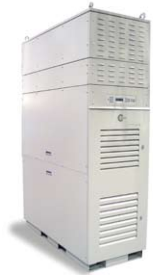
C65 CARB ICHP MicroTurbine