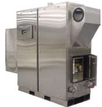
Offshore Hazardous Area