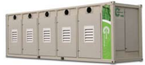
C1000 Power Package